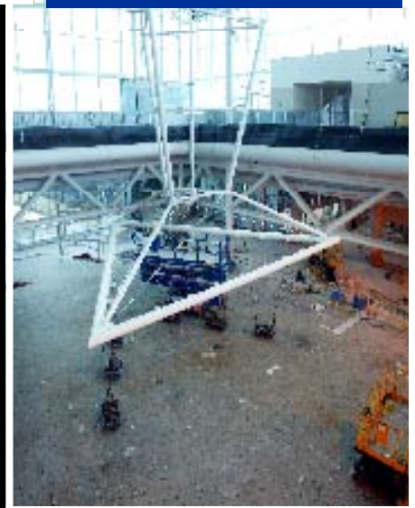
PRIMA Terra-Tech Industrial Floor Protection During Construction