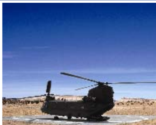
PRIMA Terra-Tech Helitile Instant Helicopter Landing Zone