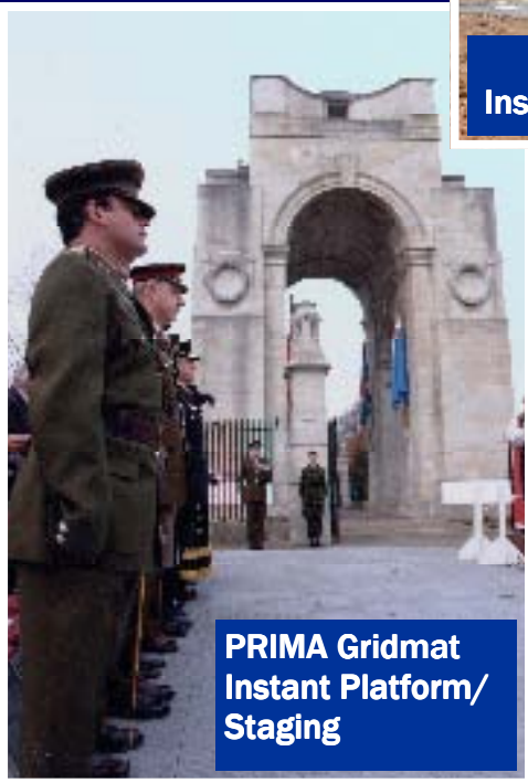
PRIMA Gridmat Instant Platform/ Staging